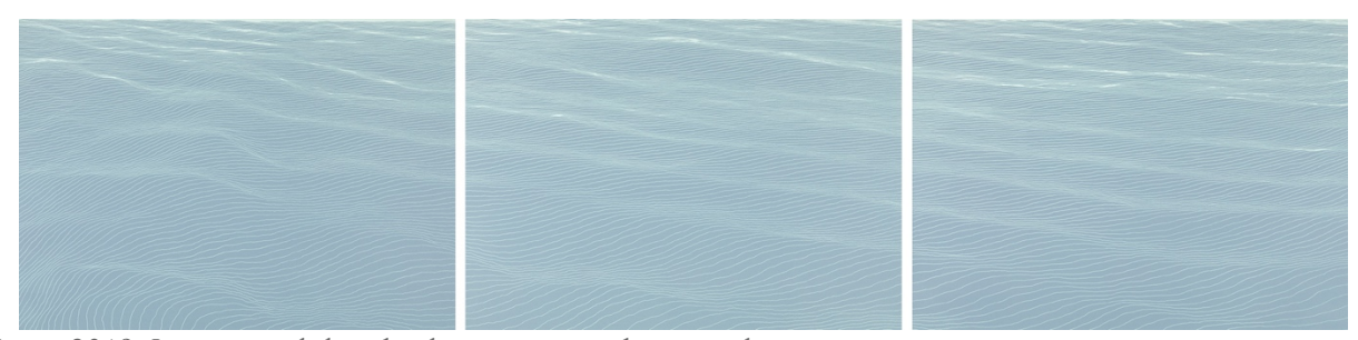
Strait, 2019, Linocut with hand coloring mounted on panel

A single line serves as the origin for Aspinwall's liminal landscapes. She allows her hand to move instinctively, recording her inhales, exhales, adjustments, and shifts along the way. The subsequent lines are an attempt to follow the path of the original, proliferating into a sea of vibrations. Despite their shared design, the tonal variances in Strait and Flare emit contrasting energies. Whether tranquil or galvanic, these abstract horizons absorb the viewer with their immensity.