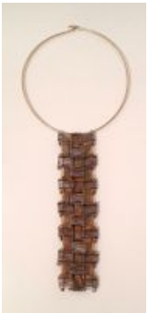
Tamiko Kawata Tie Necklace , 1999 Japanese safety pins (silver, nickel, and brass-plated stainless) with gold filled wire 11h x 5w x 2d in TAMK010