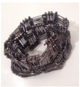
Tamiko Kawata Cleopatra Bracelet (small) , 1999 Japanese safety pins (oxidized brass-plated stainless) with sterling silver clasp 4" diameter when closed TAMK009