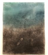
Tamiko Kawata Paper Clip Rubbing , 2011 Pastel rubbing on vellum 13.50h x 11w in Framed: 16.75h x 13.75w in TAMK097