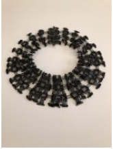
Tamiko Kawata Black Cleopatra Necklace , 1999 Japanese safety pins (oxidized brass plated stainless) with sterling silver clasp 11" diameter when closed TAMK008