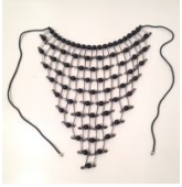
Tamiko Kawata Lacy Bib Necklace , 1999 Japanese safety pins (black fused) wood beads on black cord 7.75h x 7.50w in TAMK013