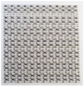
Tamiko Kawata Permutation 10 , 2018 Safety pin on MDF Board 33.38h x 31.75w x 1d in TAMK068