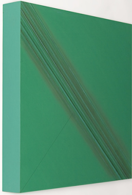
Intermezzo 19" (2015) 12" x 12" x 2.25" tin, silver, gold, copperpoint, graphite, green gesso on wood panel

SS: I used to, but mostly I listen to talk radio on NPR, but sometimes I play my husbands CD's or popular music.