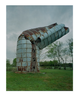
Timothy Hursley, "Alabama Silo, Hale County, Alabama" (2008), C-print mounted on Dibond, 23 1/2 x 60 in

About half the prints in the show are "dye transfer," a photographic printing technique recognized by its deep, saturated colors. The color in these photographs is sumptuous: reds, aquas, and blues pop with hyperreal richness. Color underscores strangeness in Hursley's interiors. Even the cooler-toned photos — shots of decidedly unsexy Mormon fundamentalist life and of funeral homes — are suffused with luscious tones. The beauty of the prints belies the deep loneliness of the worlds they