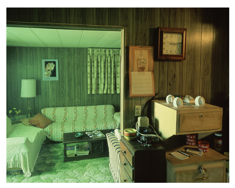
Timothy Hursley, "Desert Doll House, Hawthorne, Nevada" (1987/1990), dye transfer print, 16 1/2 x 21 in

The longer you look at these photos, the creepier they feel. It is with a keen sense of humor that the gallery hung Hursley's quadriptych "Alabama Silo" (2008) next to the brothel imagery. Four photos that portray a tall grain silo in various states of deflation are an unmistakable comment on the irony of sex.