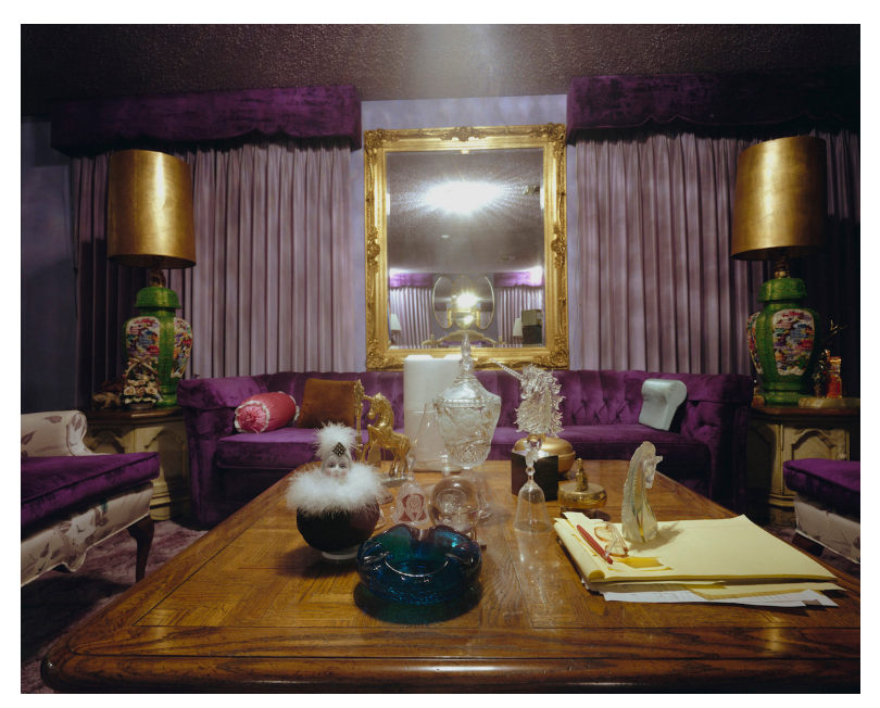
Timothy Hursley, "Joe and Sally Conforte Suite, Mustang Ranch" (1987/1991), dye transfer print, 16 1/2 x 21 in

What do the interior design of Nevada brothels, the storage caves of fundamentalist Mormons, Southern funeral homes, and Andy Warhol's Factory all have in common? They are all part of the disquieting and beautiful photographic investigations by Timothy Hursley in Tainted Lens , currently on view at Garvey Simon Art Access in Chelsea.