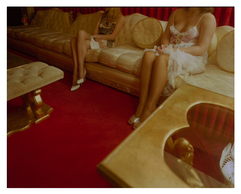
Timothy Hursley, "Girls Parlor Chicken Ranch" (1986/1990), dye transfer print, 16 1/2 x 21 in