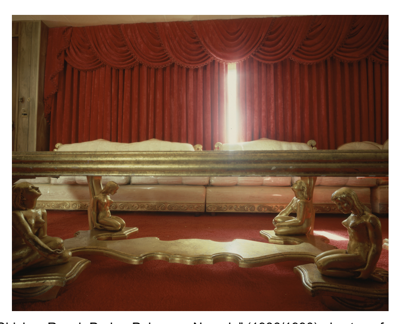
Timothy Hursley, "Chicken Ranch Parlor, Pahrump, Nevada" (1986/1990), dye transfer print, 16 1/2 x 21 in