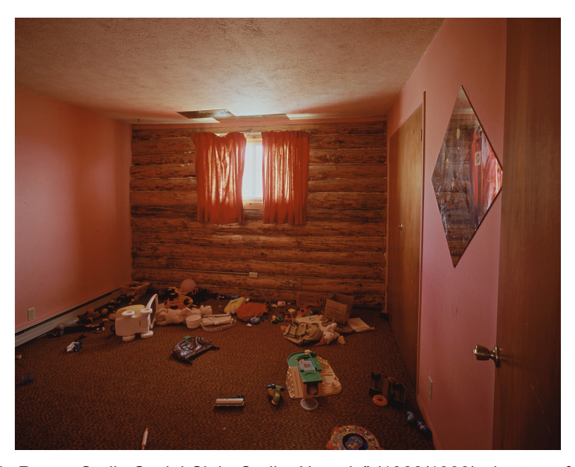
Timothy Hursley, "Kids Room, Carlin Social Club, Carlin, Nevada" (1988/1990), dye transfer print, 16 1/2 x 21 in

The image that completes the story is "Kid's Room, Carlin Social Club" (1988/1990). Here we see three sides of a room, two painted a sickly pink and the third with the veneer of a log cabin. There is no furniture, just ubiquitous red carpeting strewn with discarded and broken toys. We don't know if this is a place to park your children while being serviced or a "playroom" for the children of employees. Either way, the message is grim.