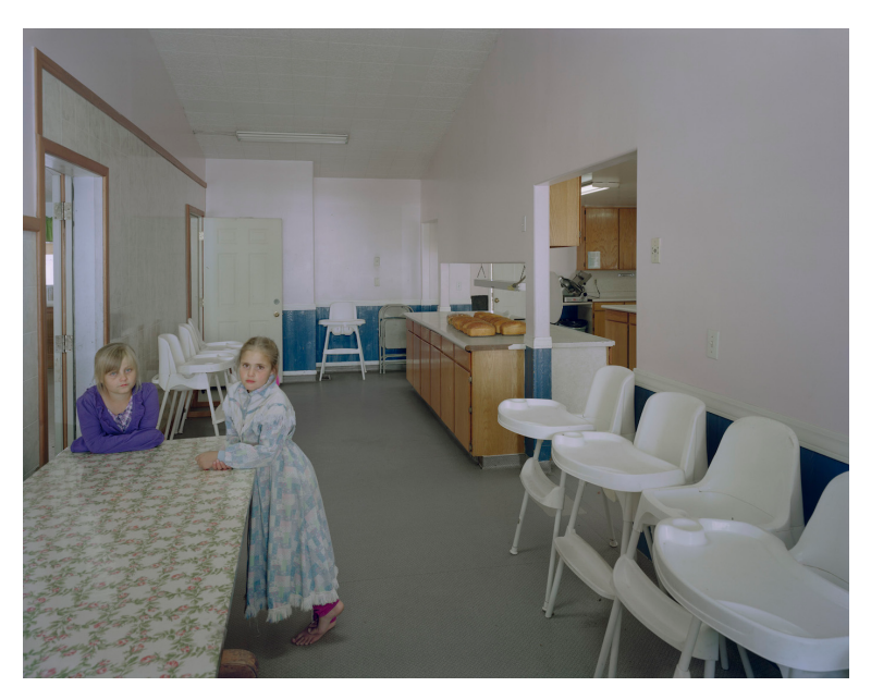
Timothy Hursley, "Polygamist Girls, Bountiful, British Columbia" (2010), C-print mounted on Dibond, 27 1/2 x 34 in

And what stories he tells! Some of the most moving work in the show is of empty brothel rooms, architecture designed for artificial gaiety, sex, and commerce. They are laden with heavy, hot color, garish furnishings, and utter loneliness. There are four related photos from brothels in Nevada hung next to each other that tell a short story in pictures. They all share the same decorating scheme: cheap gold furniture that, to some, might convey a dream of luxury, and light filtered through heavy red curtains drawn lazily against the desert sun. In "Girls Parlor" (1986/1990), we see the off-kilter bodies of two women on a couch — just their bodies, from neck to floor. They sit, carefully placed apart on a white couch, a space wide enough for a man to sit between them, their sagging breasts and passive flesh clothed in negligees. We peer through the base of a coffee table in "Chicken Ranch Parlor" (1986/1990). The ornate decorative golden nude women holding up the marble tabletop don't look sexy; they look like slaves.