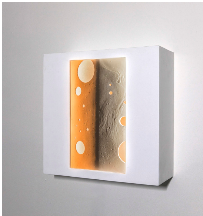
Untitled , 2019, resin, wood, canvas, LED lights, 21.5 x 21.5 x 8 in.

Garvey | Simon is pleased to present Exploring Light , a new series of illuminated, sculptural works by Bentley Meeker. The exhibition will take place during Armory week at 517 W. 37th Street NY, NY 10018, a street level gallery space in the Hudson Yards district in close proximity to the fairs. The show will be open and on view Tuesday - Saturday, 11am-6pm, and by appointment. An artist talk will be held in the gallery on Saturday, March 16, at 2pm.