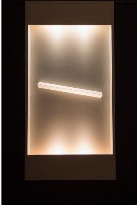
186,281, 2012, National Arts Club