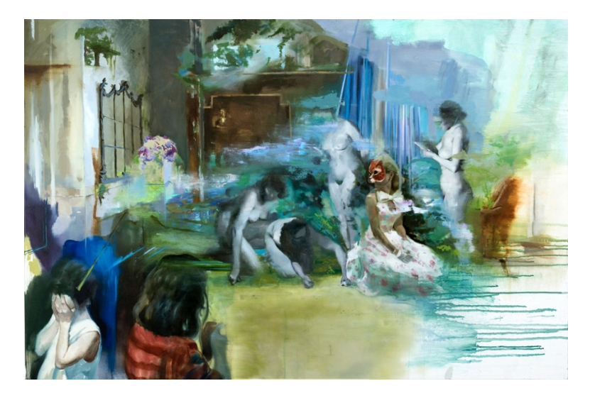
Joshua Flint, The Dressing Room, 2017, oil and acrylic on canvas, 48 x 72 in.

JOSHUA FLINT stages the scenes of his paintings using elements drawn from archival images and found photographs. Flint interjects a slippage between the narrative in the composition and its historical context, shifting between impressionistic swathes of color, and hard-edge realism. When designing these scenes, Flint employs digital software to create collages, adding or subtracting elements from his source-image. The result is an ethereal and unmoored representation of the near past. Flint lives and works in Portland, Oregon.