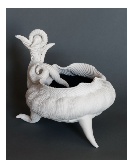
Charles Birnbaum, Kharon Ferrying a Soul, 2018, porcelain, 8 x 7 x 7.5 in.

CHARLES BIRNBAUM points to Jungian archetypes as inspiration for his porcelain sculptures. Though inherently abstract, Birnbaum's sculptures share an aquatic, and perhaps primordial lineage. Sensuous curves and textures are countered by bone-white sterility, complicating the viewer's attraction to their expectant form. Birnbaum currently lives and works in Brooklyn, NY.