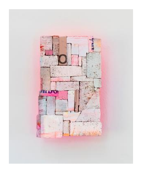
Joan Grubin, Detritus #50, 2015, Acrylic on pressed wood, 5 x 3 inches.

from Tulsa in 1960 and gained early recognition with his first solo exhibition in 1965. Over the next decade he exhibited regularly and his work was included in numerous museum exhibitions in the United States and abroad. His works are in the permanent collections of the Metropolitan Museum of Art, the Museum of Modern Art, the Whitney Museum of American Art, Berkeley Art Museum among many others. Brainard gradually stopped making and exhibiting art in his mid-30s and devoted much of his time to reading thereafter.