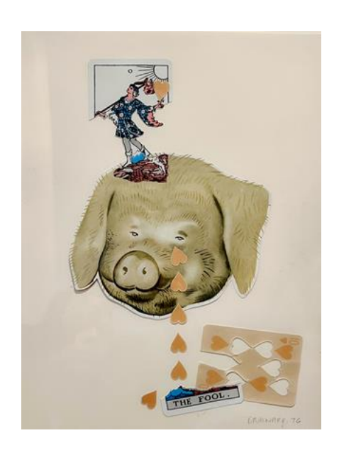
Joe Brainard, Untitled (The Fool), 1976, Mixed media collage, 14 \times 11 inches.