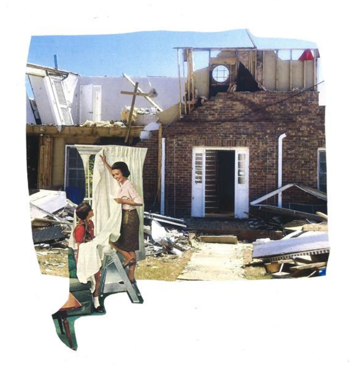
Sharon Shapiro, Drawing Drapes, 2022, collage on paper, 11 x 12 in.