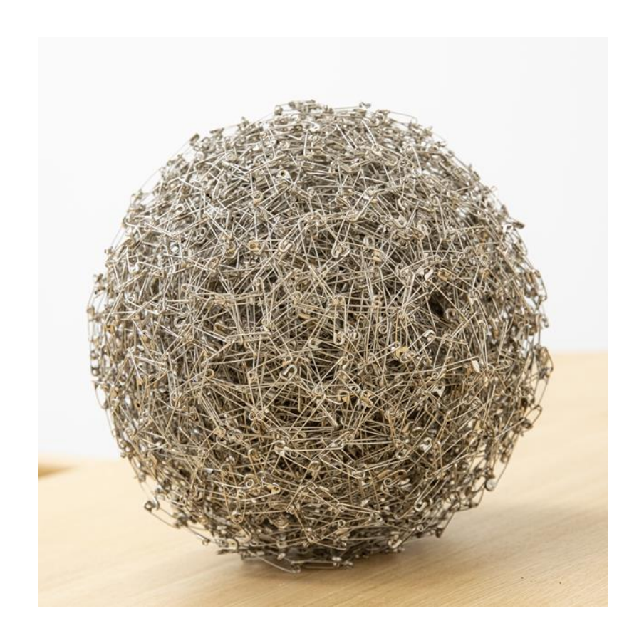
Tamiko Kawata, Silver Sphere , 2014, steel safety pins and nickel plating, 11 x 11 inches.